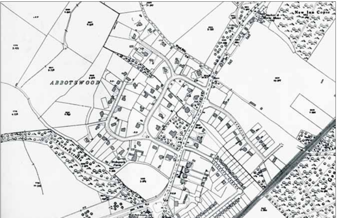
Ordnance Survey Map 1934