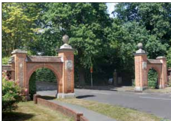
The entrance archways

The estate is entered via a pair of distinctive brick arches and wide curved screen walls set back from the London Road. The archways are a defining focal point for the estate which is clearly read as a distinct residential area on approach from London Road.