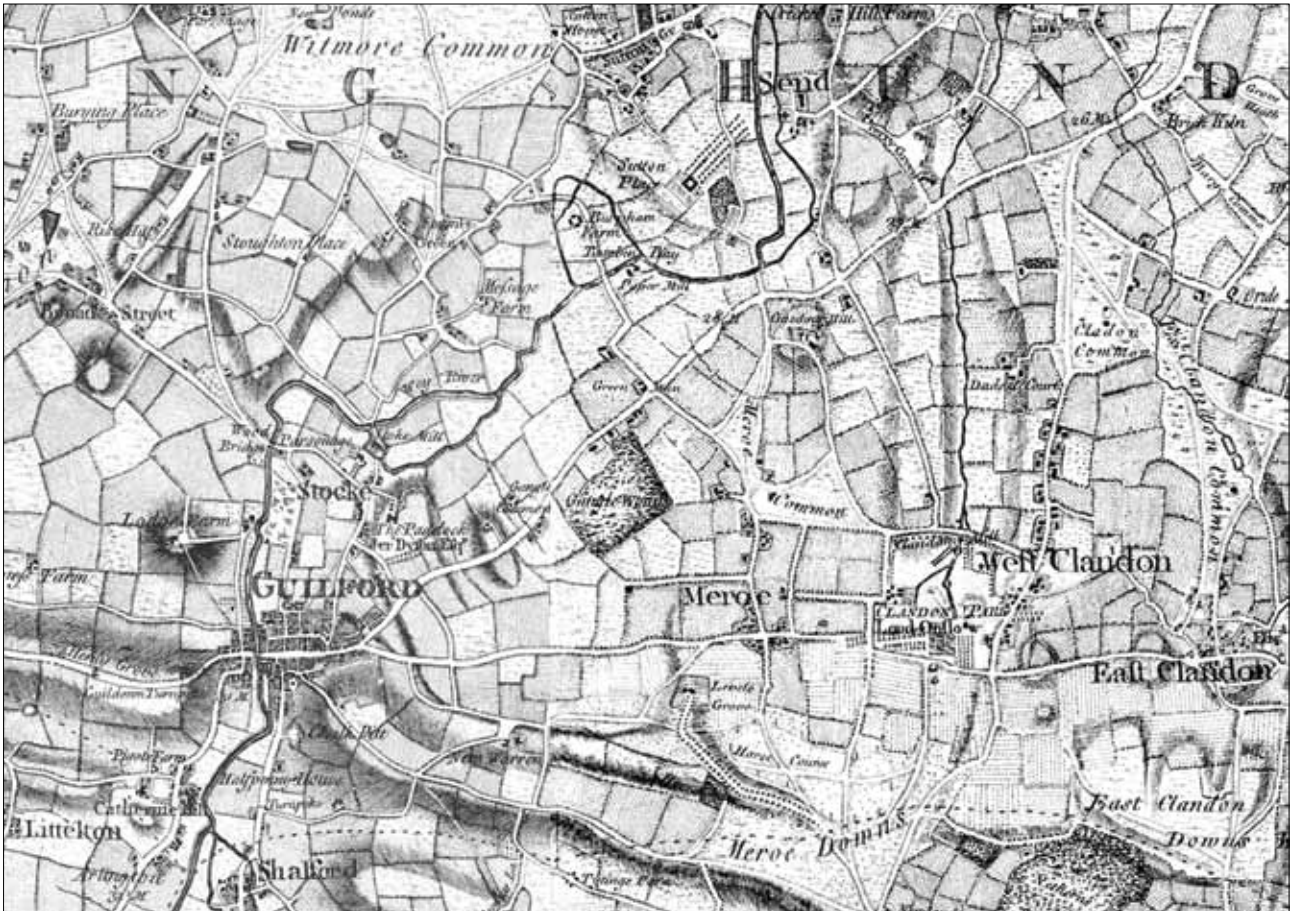
The Roque Map dated 1768