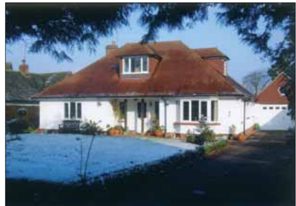
Number 23 Baile on Aba

The bungalows were the first properties to be designed by Burlingham and built on the estate after the Great War. The decline in house building during the war had led to an acute housing shortage immediately after the war. The Government aimed to encourage house building by providing a grant based on floor area through The Housing (Additional Powers) Act 1919. These bungalows were a method of providing affordable housing with maximum floor area at minimum cost.