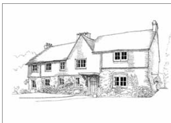
Stoke Park Farm House