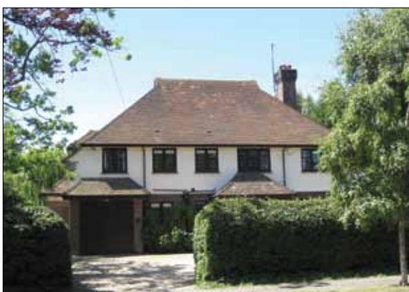
Number 3, Abbotswood

Almost all the original houses are found to have sister houses of the same design, and in some cases, a number of variants. In some cases the designs are simply mirrored or handed, such as at numbers 21, 14, 44 and 37, to allow the principal rooms to face south on different plots with different orientations. There is one instance where five dwellings were all built to the same design and one example where there are three. But generally most designs were simply duplicated. Only five houses on the estate are unique. Examples of houses that fit this unique category include numbers 1, 6, 13, 24 and 46 Woodways, which is a listed building.