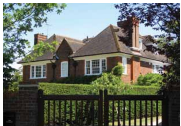
Number 38b Abbotswood

Prior to the conservation area appraisal there were no buildings on the local list for Abbotswood. As part of the appraisal of the conservation area, and through the consultation process and local support. A number of buildings are now included on the local list. Some of these are described in the management plan and all are marked up on the townscape appraisal map in Appendix 2a. Locally listed buildings do not have any additional statutory protection. However, inclusion on the local list is a material consideration when planning proposals are determined. The setting of a locally listed building will also be taken into account when considering related development proposals.