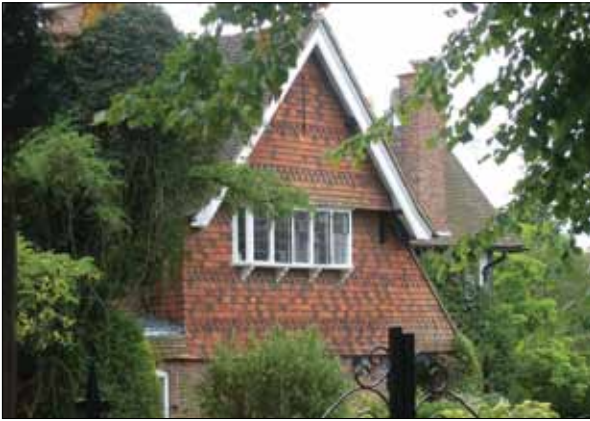
Tile hanging with string courses in club tiles

and colour that gives the tile hanging its charm and character. The lowest course of tiles is always jettied out from the building to shed rainwater away from the brickwork and windows underneath.