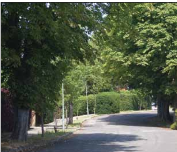
The central crescent

On London Road the large mature oaks dominate and frame the busy main thoroughfare while the entrance archways into the estate presents a strong architectural focal point. The second entrance to the estate further north is less imposing and restrained but the unmarked road and lack of street signage and clutter indicates its quiet suburban character in contrast to the busy main road from which it is accessed.