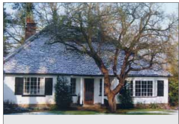
Number 27 Greenmantle

There were three basic designs, including a simple design employed at numbers 23, 25, 27, 28 and 43, and a more elaborate design at number 38 which featured two projecting bays on the front elevation, one hipped and one gabled. They all featured simple hipped clay tiled roofs with hipped dormer windows.