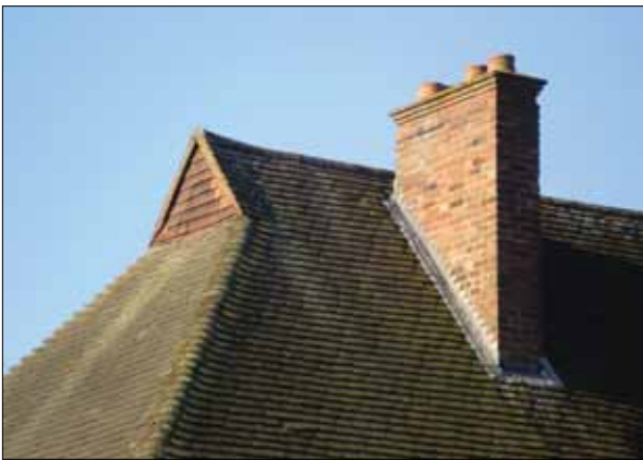
A Gablet, a typical Surrey feature