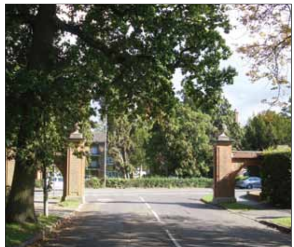
View looking out of the estate toward London Road

From the westerly edges of Abbotswood there are glimpses and distant views over the Wey Valley and the Riverside Nature Reserve. Looking outwards from Abbotswood onto London Road there are glimpses of the Victorian Villas lining the opposite side of London Road framed by mature trees.