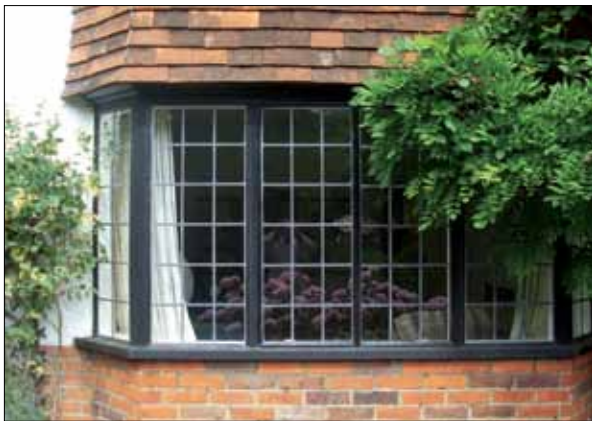
Leaded lights in oak surrounds

The leaded lights varied in shape between diamond and square, there being no particular rule. Indeed in some houses, both diamond and square shapes are used on the same property but on different elevations.