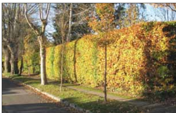
Typical beech hedges