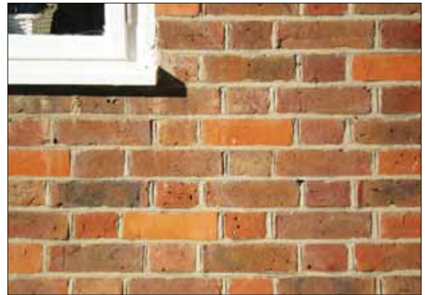
Rudgewick multicoloured stocks with Warnham Reds

All the original properties in Abbotswood employ brickwork using mostly locally available handmade multicoloured stock bricks. The vast majority are mottled, notably Rudgewick multi-coloured stocks which are still available today. These are interspersed with the lighter Warnham Reds, both coming from clay beds not far to the north of Horsham. Most of the external brick walls are constructed in eleven inch cavity brickwork with facing bricks in stretcher or English bond. In all cases lime mortar was used in brickwork.