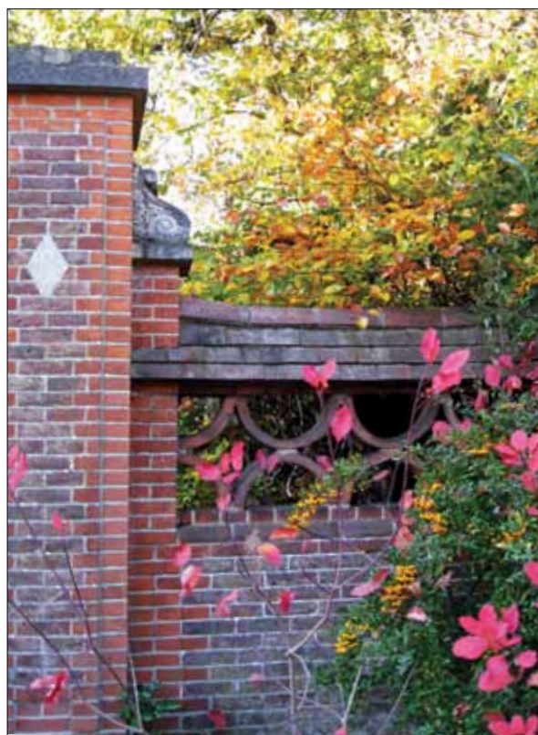
Entrance archway detail

As with listed buildings there is a general presumption in favour of the retention of buildings deemed positive. Any application for the demolition of a positive building will therefore need to be accompanied by a reasoned justification as to why the building cannot be retained. This is similar to the justification required for a listed building. The owner must also have made positive efforts to market the building before an application to demolish can be determined.