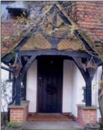
Porch to Number 1, The Gatehouse