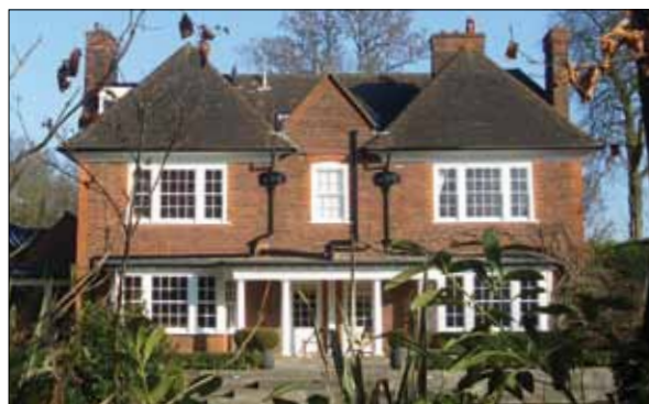
Number 38B, Abbotsmead

Designed in the Queen Anne style, Upmeads has five bedrooms and three reception rooms, with attic space in the loft for three other rooms. The brick elevations are largely symmetrical and combine local multi-coloured stocks with the attractive use of Warnham red quoins to window and door openings. Unique to Abbotswood, early Georgian sash windows were used at ground and first floor level.