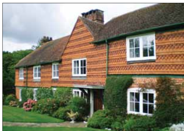
Stoke Park Farm House

It has a plain clay tiled roof and there is a large imposing triple chimney stack just off centre within its main roof range, with further stacks to the rear and ends. It now stands within a large garden together with some of the original outbuildings, but its original setting has been changed.