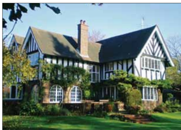
Number 39, Greystones

Most, if not all, of the original houses on Abbotswood were designed in the Arts and Crafts Style at the beginning of the twentieth century by the architect Alfred Claude Burlingham.