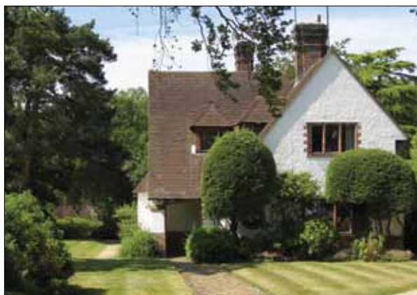
Number 6, Abbots Lodge

Abbots Lodge comprises three bedrooms and two reception rooms. Externally the elevations are in roughcast render on brick