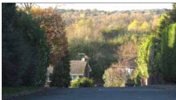
View over nature reserve