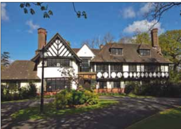
Number 46, Woodways

Woodways is the largest house on the Abbotswood estate. Designed in 1913 by Alfred Claude Burlingham in the Arts and Crafts Style, the building is rendered on a brick plinth with decorative half timbering at first floor level. It has a clay tiled roof with dormer windows with tall brick chimneys, some set diagonally. Fenestration is in the form of leaded lights set in steel casement windows painted black set in stained black oak frames.