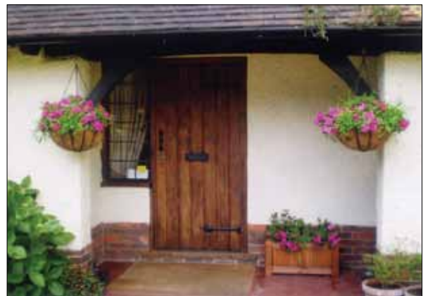
Typical recessed porch

The porches on Burlingham's houses are usually recessed into the building footprint and are quite generously proportioned with terracotta tiled floors. On occasions, and particularly on his larger houses, the porches extend in front of the building with hipped or gabled clay tile roofs supported on stained oak posts, beams, braces and trusses, all held together with oak pegs and dowels. The Gatehouse has a particularly fine example.