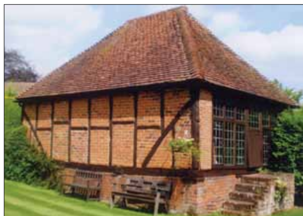
Stoke Park Farm barn