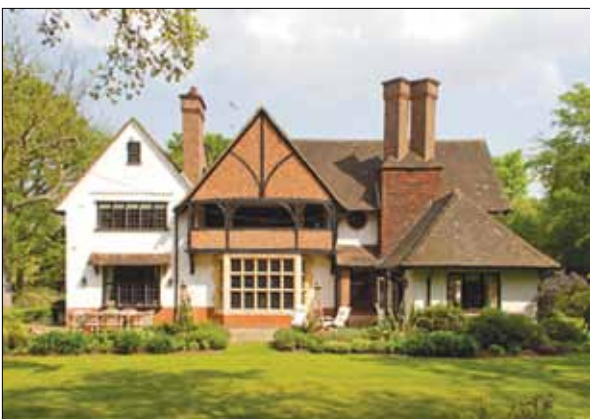
Number 46, Woodways

The servant's accommodation has a hipped roof with hipped dormer windows. The first floor is half timbered in quatrefoil pattern and jettied throughout. Fenestration again is in the form of leaded lights in steel casements set in oak surrounds.