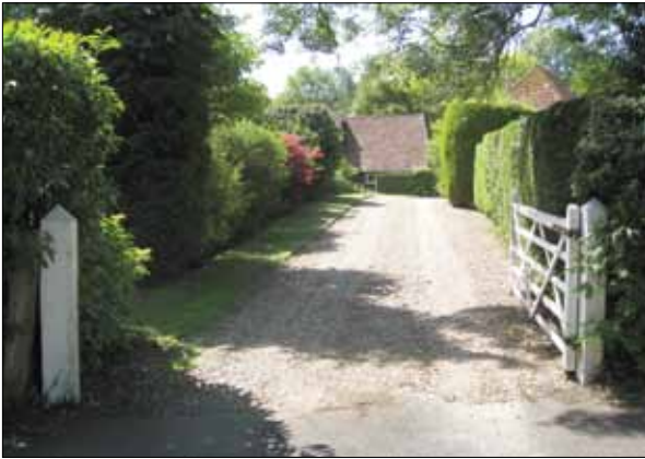
A gated entrance