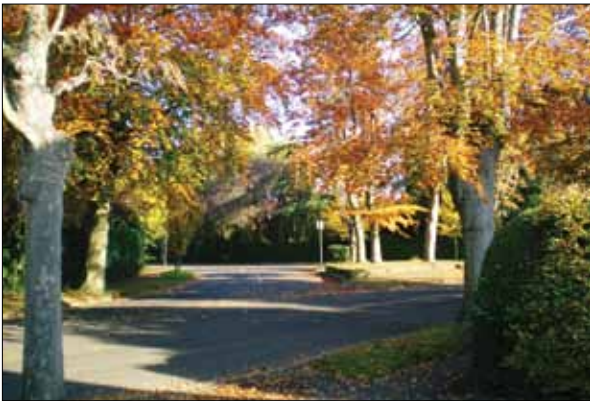
Post box island

A short distance in from the main entrance to the estate, where the road divides, there is a central island featuring a raised bed with stone retaining walls. The island includes a number of mature copper beech and chestnut trees, and the original post box enclosed in a brick surround which still retains a faint trace of the white paint used during the Second World War to identify the post box during blackouts.