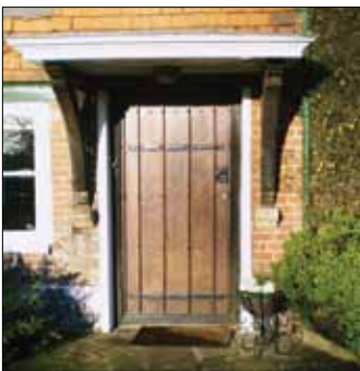
Typical oak front door

with a cottage style latches so typical of the buildings by Lutyens and Baillie Scott. Hinges, latches and plates often have a floral or heart shaped motif again typical of the Arts and Crafts style.