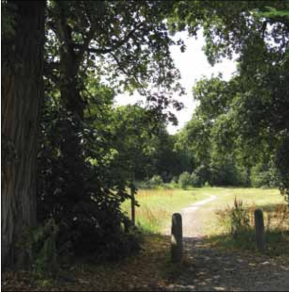
Entrance to the Paddock

The passer-by can view into the estate at three points from the London Road. One view is across the Paddock where occasional glimpses of the original Stoke Park Farmhouse and its outbuildings can be seen. The view across the Paddock onto Thorneycrofts is distinctly rural and invites the walker to enter.