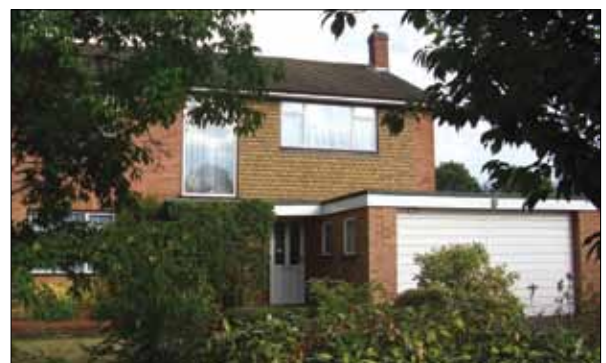
Typical 60s infill development

There was also a marked change in building materials away from handmade to cheaper factory-made components. In place of local handmade bricks, machine made calcium silicate bricks became fashionable with their pale uniform colour. Cheaper concrete tiles were preferred to traditional clay tiles, and factory made windows were selected from catalogues with a preference for large picture windows.