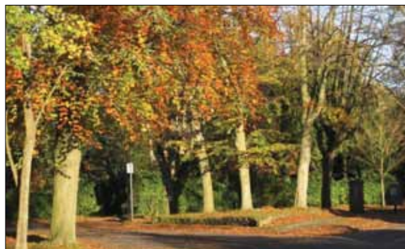
Typical tree scene

The boundaries bordering the roads are predominantly mature 2 metre high hedges in a mix of privet, laurel and beech.