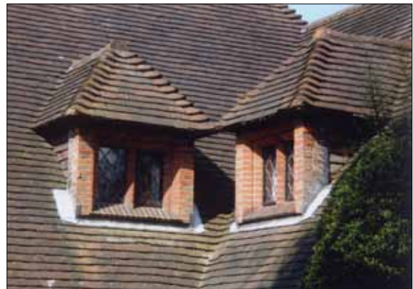
Brick mullions using special cant bricks