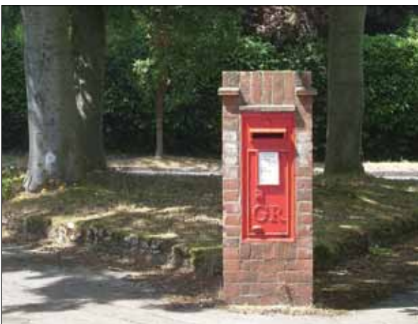
The post box

A short distance in from the main entrance to the estate, where the road divides, there is a central island featuring a raised bed with stone retaining walls. The island includes a number of mature copper beech and chestnut trees, and the original post box enclosed in a brick surround which still retains a faint trace of the white paint used during the Second World War to identify the post box during blackouts.