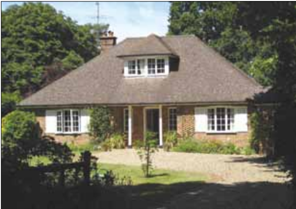
Number 25 - typical Burlingham bungalow

All the houses used Crittall standard steel casement windows rather than leaded lights in oak surrounds, which reflects both the financial constraints and the shortage of building materials following the war. Unusually, many of the bungalows feature decorative shutters either side of the windows, perhaps a throw-back to their Imperial origins.