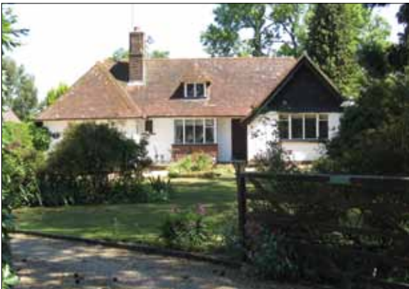
Number 38 The Orchard

All the houses used Crittall standard steel casement windows rather than leaded lights in oak surrounds, which reflects both the financial constraints and the shortage of building materials following the war. Unusually, many of the bungalows feature decorative shutters either side of the windows, perhaps a throw-back to their Imperial origins.