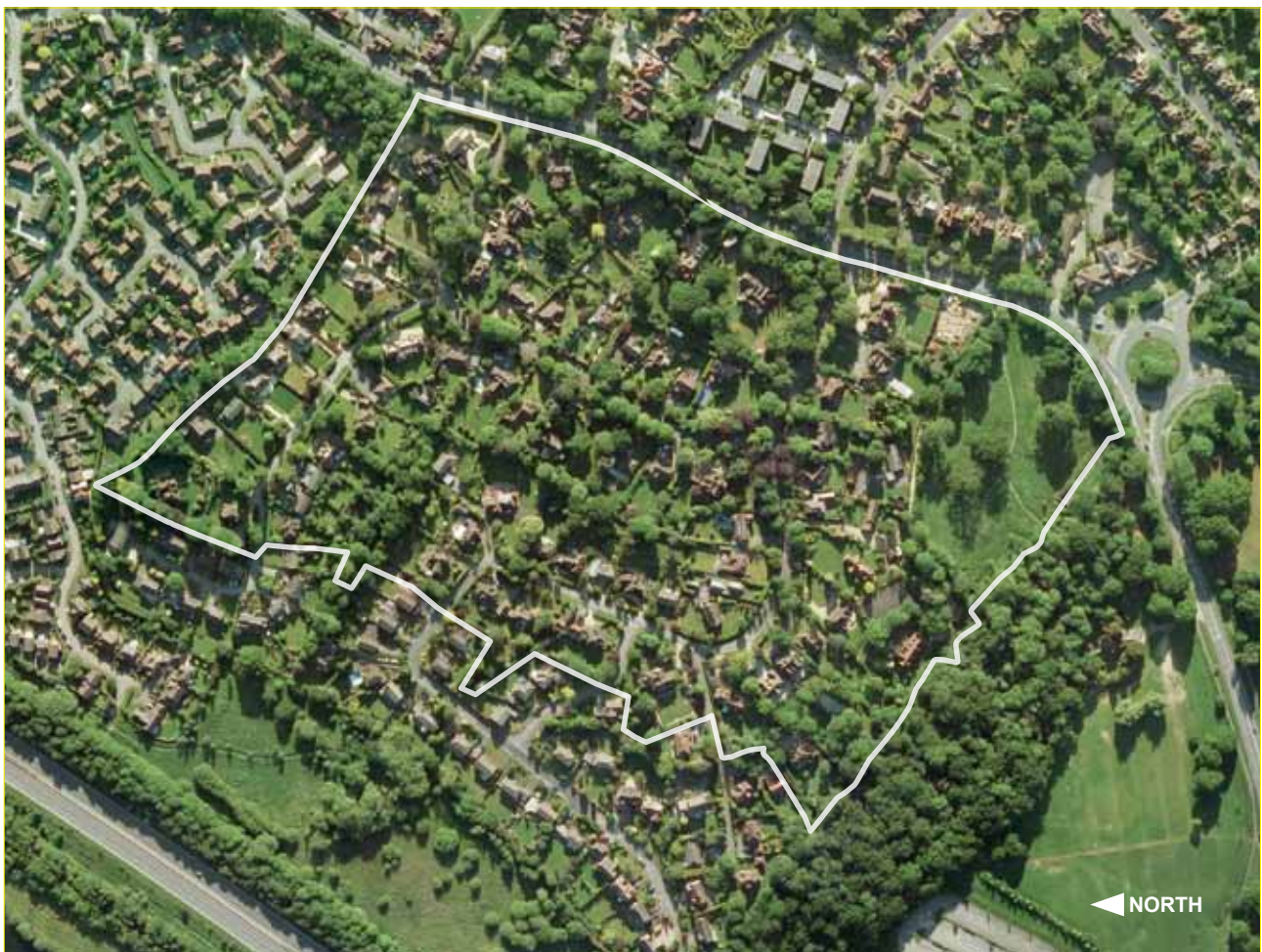
Aerial view of the estate

Abbotswood today represents a fine example of an Edwardian garden suburb of distinctive quality and character due mostly to the harmonious and cohesive design of its architect Alfred Claude Burlingham who was responsible for its layout and the design of most of its buildings. The buildings are representative of the Arts and Craft style with use of traditional materials and detailing and careful attention to craftsmanship and execution. The siting of houses and the quality of the landscape setting are important features of the urban form of the estate and contribute to its overall significance.