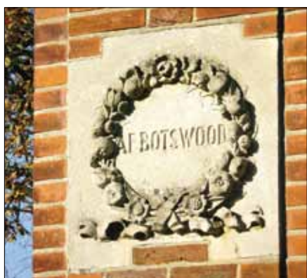
The Abbotswood plaque

The central brick columns each have a cornice of bath stone surmounted with stone finials in the form of acorns decorated with oak leaves. The word Abbotswood, surrounded by a wreath, is carved in stone plaques on each pillar.