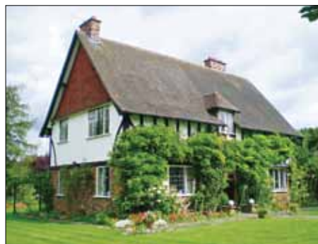
Number 22, Langton House

Where house designs were mirrored or duplicated, Burlingham often used a pallet of materials to ensure that no two houses were alike. One of the earlier types had a tile hung version (Number 40) and a half timbered version (Number 39).