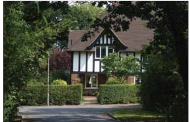
Typical stop end view

Inside the conservation area, views of tree lined roads and their wooded backdrops prevail. Views are also dominated by mature gardens to the fronts of, and between houses. This and the presence of bungalows of lower height and scale means that the built environment does not significantly intrude into the arcadian scene.