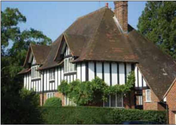
Coppice Mead with catslide roof