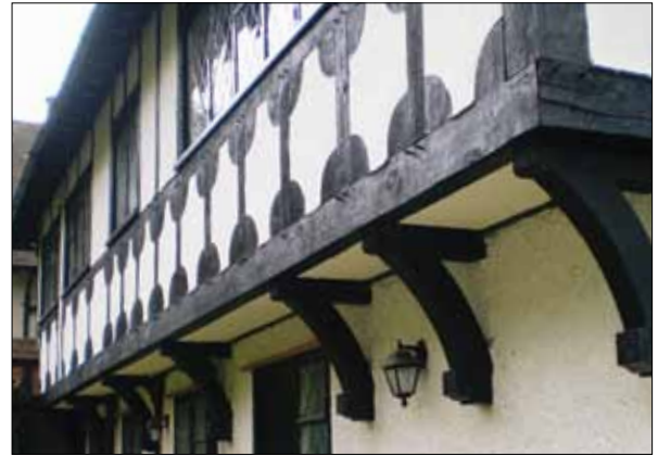
Quatrefoil half timbering showing pegs