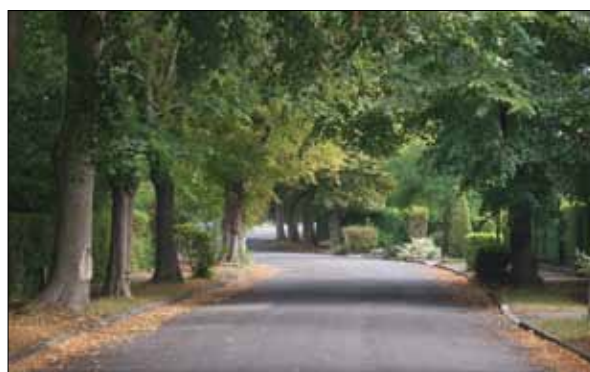
The central crescent

kerbs. In some areas footpaths are set back from the road edge behind lightly raised grassed verges lined with low stone edges. The trees in the verges are generally mature oak trees, copper beeches and horse chestnuts. Significant groups of mature trees are highlighted on the townscape map. The sylvan landscape and open space within Abbotswood also supports rich and varied wildlife including stag beetles and grass snakes, as well as bird species that appreciate mature trees and the insects they contain such as green and greater spotted woodpeckers and nuthatch.